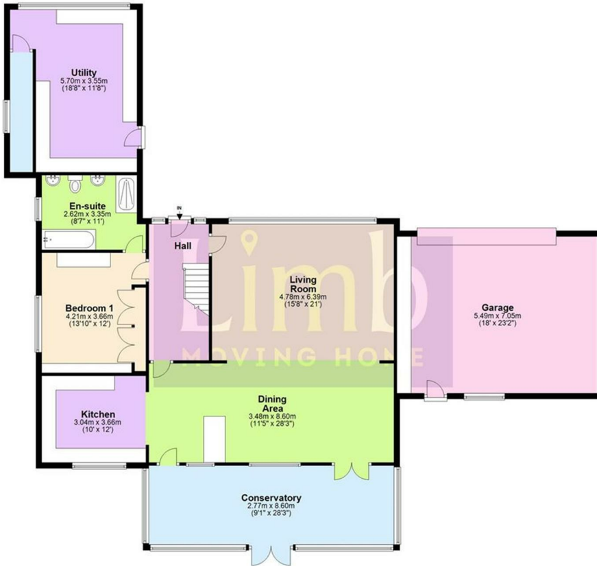
Ground Floor Approx. 198.7 sq. metres (2139.3 sq. feet)